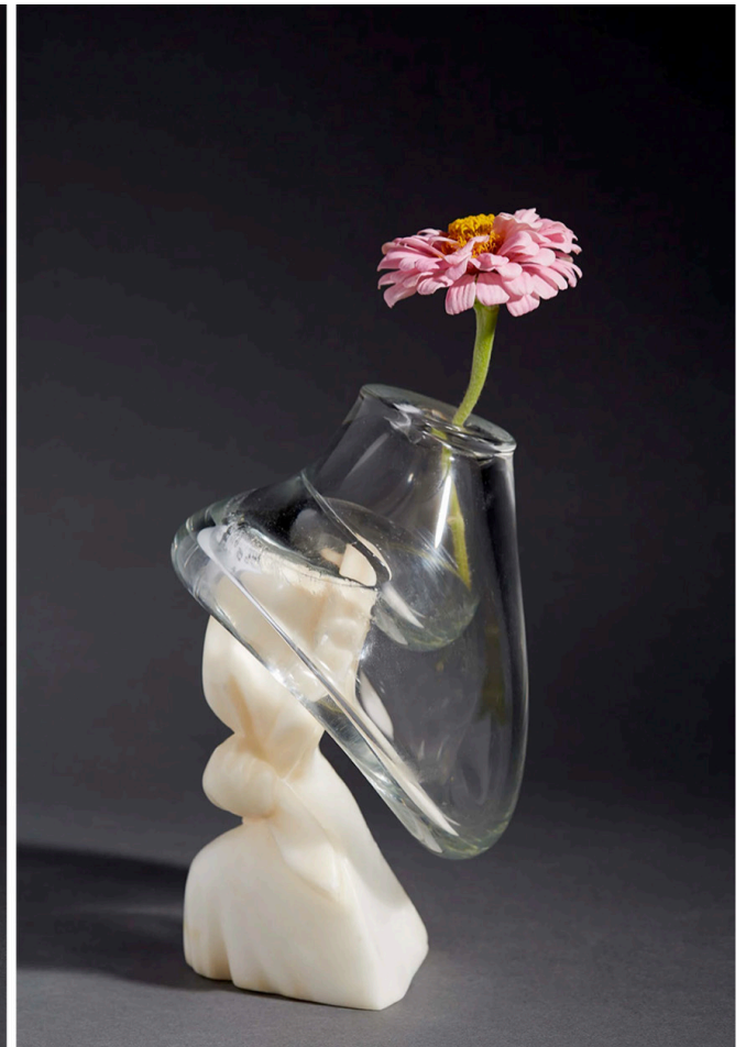
Left: “Soften the Blow” (2021), walnut and glass, 9.25 x 10 x 7.5 inches.